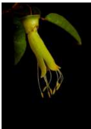
1 st Place – Macro Correa