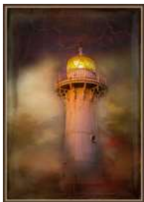
1 st Place – Creative Art Warden Head Lighthouse

Christa Drysdale took out four awards as follows: