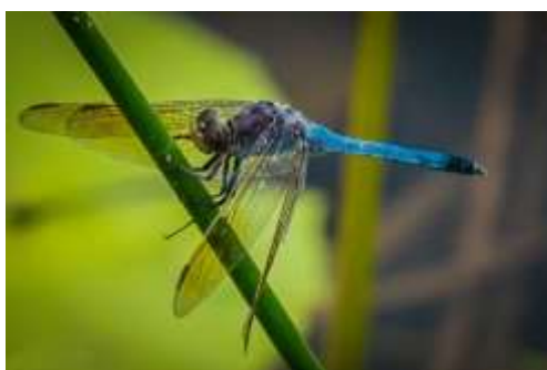
2 nd Place – Macro Dragonfly