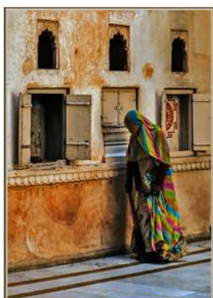
A Woman in India

In addition, Christa Drysdale received seven Acceptances in the prestigious 2017 Maitland International Salon of Photography competition which attracts around 4500 entries from 55 countries ( maitlandsalon.myphotoclub.com.au ).