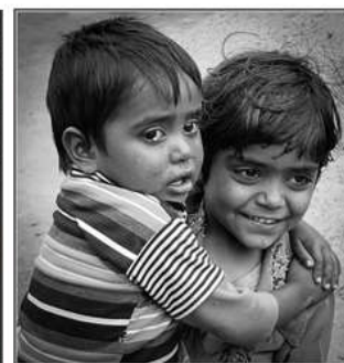
Sad Face - Happy Face