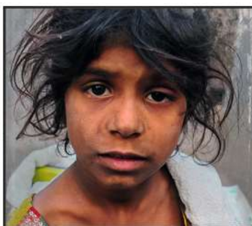
Street Urchin in India