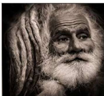
The Face of India