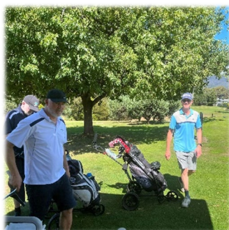
Newstead Plaster & Insulation – 3 person Ambrose