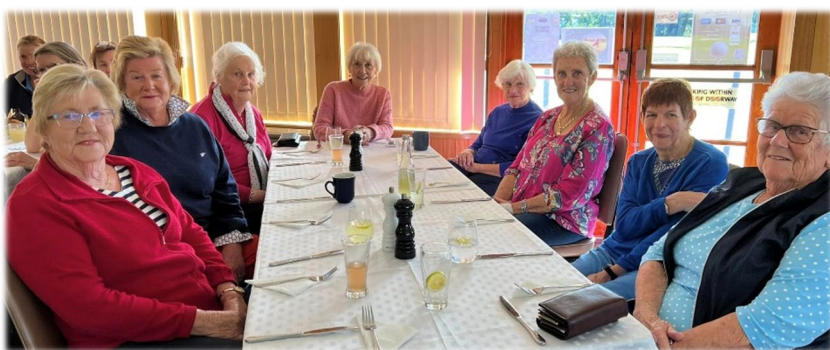
Ladies' Officials Day – Canadian Foursomes and lunch (with some familiar faces!)