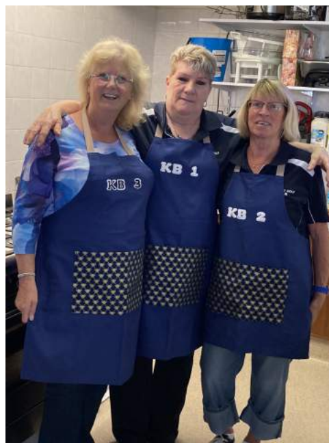
New aprons for the kitchen babies

The Orford Golf Club is available to anyone that wants to hold a function. Birthday, wedding, family get together or any type of party. Our kitchen is able to produce a menu, tailored to your needs. Contact Raylene at the club, to see what we can offer. Our aim is to put together a great catering package to ensure your event is a huge hit. We cater for small groups or large groups up to 100 people. A warm fire and extra room heating will keep you and your guests comfortable.