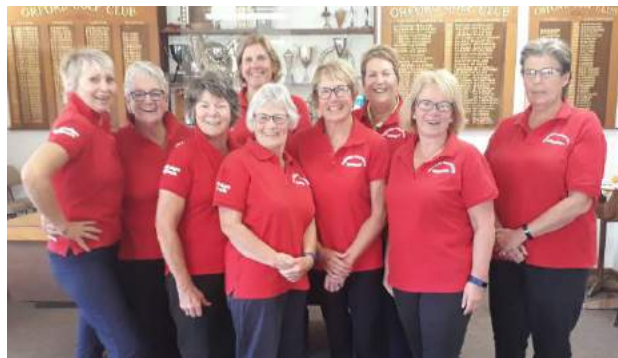
Orford Golf Club Ladies Division 3 Pennant Team, looking resplendent in their Knight Frank golf tops.

All trees that require removal have been identified and marked. Removal work will be carried out over the next three months.