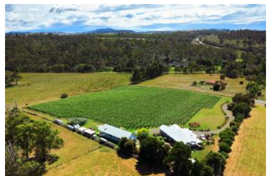
The picturesque Darlington Vineyard