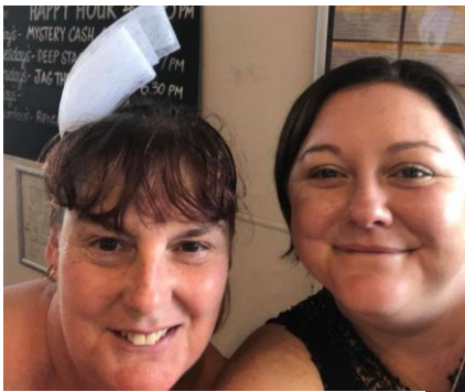
Last years Cup volunteers!

RAFFLE/MELB CUP Help Needed !! We are looking for 2-3 parents to help sell raffles/Melbourne Cup Sweep on Tuesday November 5th (from approx. 9.30 am to 4pm) at the Brighton Hotel. Two of our lovely ladies that have done it the past few years have moved away so we need some new volunteers. Please see Graham or Tracey ASAP if you are interested in helping out.