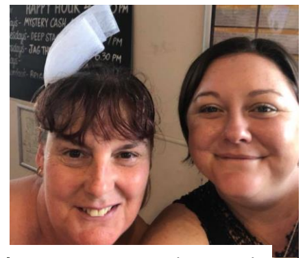
Last years Cup volunteers!

Please see Graham or Tracey ASAP if you are interested in helping out.