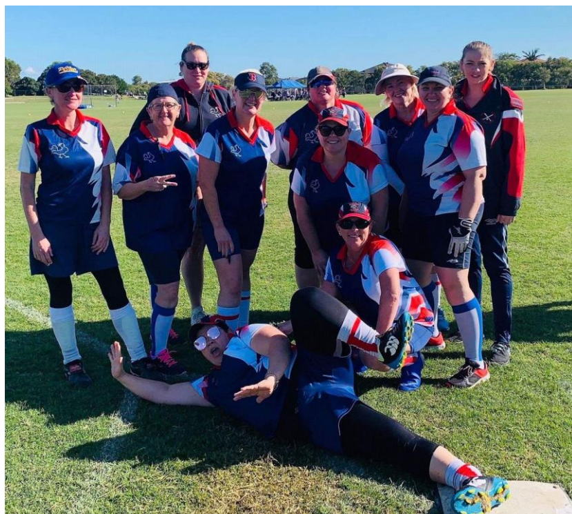
2019 MASTERS TEAM 2