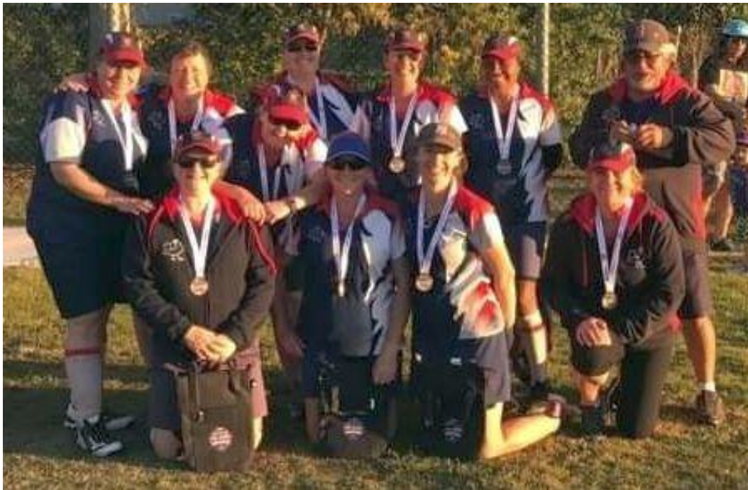
2019 MASTERS TEAM 1 – SILVER medalists